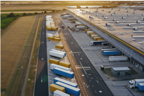
Power supply for logistics centers