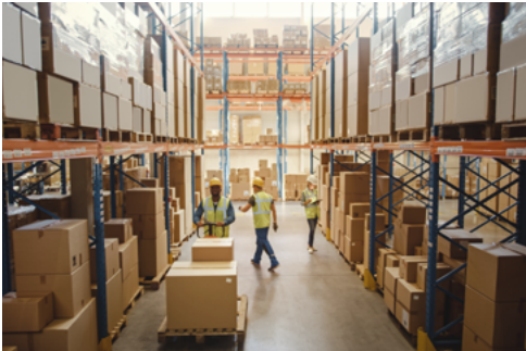
Building infrastructure and trailers