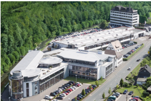
We are MENNEKES