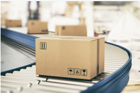
Power supply of systems technology